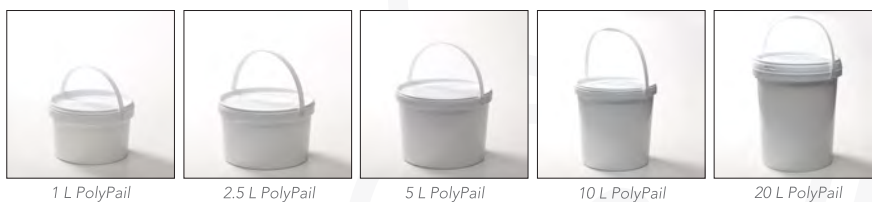
1 L PolyPail

** Standard pallet is 1.2m x 1m with load up to 2m high