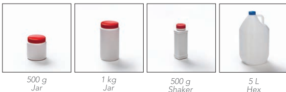
500 g Jar