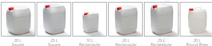
20 L Square