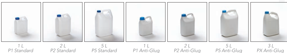
1 L P1 Standard