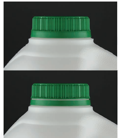
Upon opening, the tamper band drops down to make tampering more visible. The tamper band remains securely attached to the bottle to reduce littering.